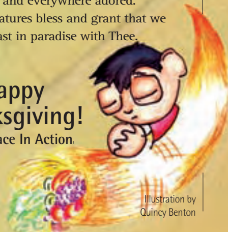
Illustration by Quincy Benton

Happy Thanksgiving! from Grace In Action.