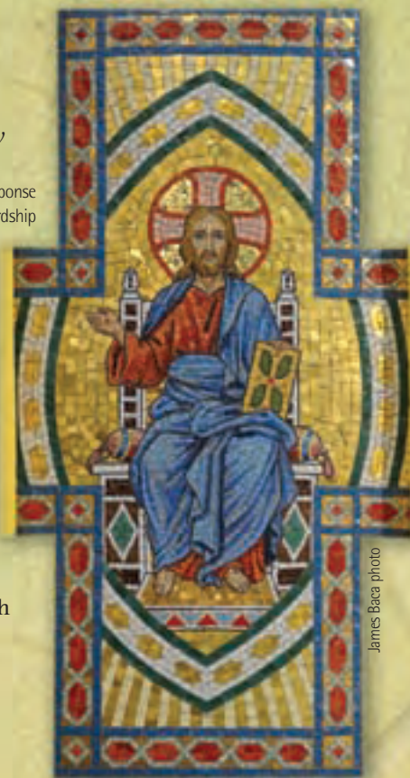
James Baca photo

What are the top three items on your gratitude list? To whom might you send a long overdue thank you?