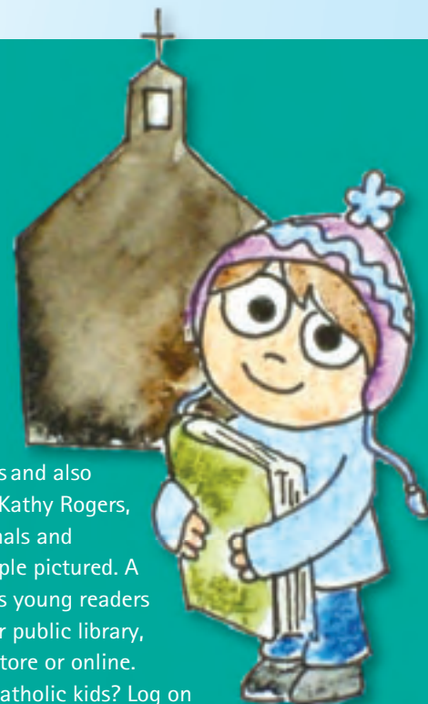
Illustration by Quincy Benton

Do you have a favorite book for Catholic kids? Log on to www.graceinaction.org and add your title and author. We'll post a list of literary recommendations for little ones.