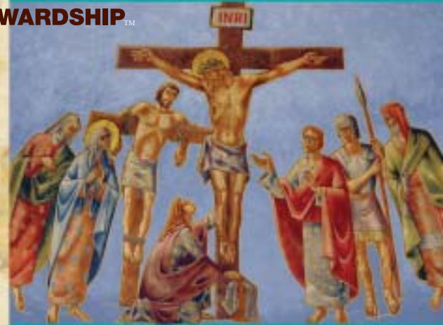
James Baca photo