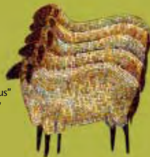
In Latin, "Agnus" means "lamb."