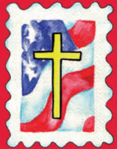
Illustration by Quincy Benton

prayer requests are kept confidential, placed in special secure prayer boxes in the crypt church near the altar, and are included in all the shrine's daily Masses and devotions. To light a votive candle, a donation is requested; you may pay online by credit card or PayPal. Log on to www.graceinaction.org for a link to the shrine's website.