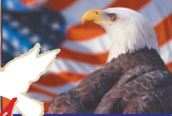
The eagle symbolizes the U.S., and also St. John the Evangelist